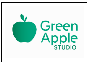
PHOTO DAY @ JOCKVALE - PHOTOS ARE READY TO VIEW - Photo day took place on Thursday, October 12th, 2023. Every child who had their photo taken was given an individualized card with a code. Please visit greenapplestudio.ca and enter your webcode to access the photos. Families should order their photos by November 2nd to enjoy free delivery to the school. Photo retake day is on November 15th, 2023.

JOCKVALE ON INSTAGRAM - Jockvale is on Instagram! You can find us by looking up @jockvale.ocdsb, where we share photos featuring student work, class activities, and school events. Check us out!