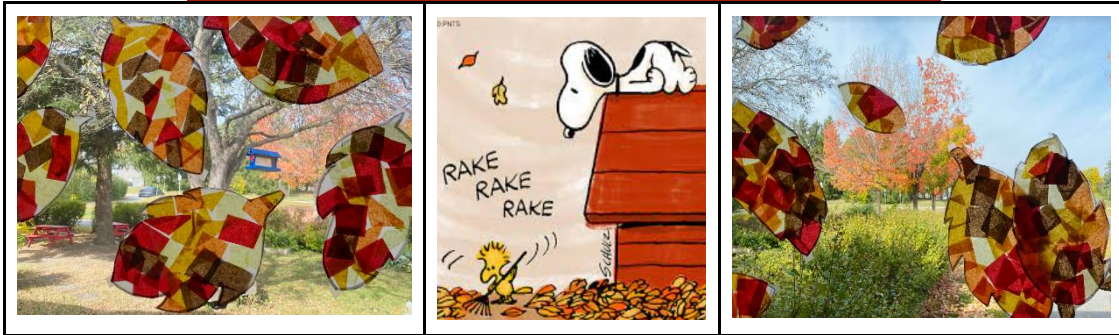
Art courtesy of the Bees Class (KJSB).

We are grateful for working at a school with lovely students, an amazing staff, and a supportive community! Wishing our Jockvale families a wonderful long weekend!