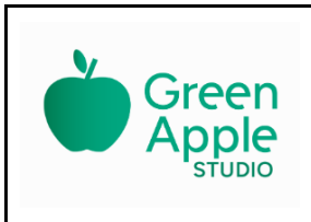
PHOTO DAY @ JOCKVALE - Photo day is scheduled for Thursday, October 12th, 2023. Green Apple Studio photographers will be at Jockvale all day for photos. Photo retake day is on November 15th, 2023. Say "cheese"!